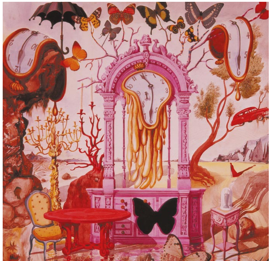
Dali on time: we take a more flexible view of the clock than did previous generations.

The moment that Neil Armstrong and Buzz Aldrin took humankind's first steps on the Moon, 30 years ago, characterizes one of the peaks of human technological progress. The event concerned everyone from an intellectual and moral point of view, but the technological impact on our everyday lives appeared minimal. In those days we had no fax, e-mail, Internet or mobile phones. Although we had the capacity to send men walking on the Moon, we were still very slow